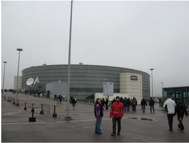
The Hartwaal arena in Helsinki outside,