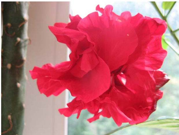
A very big hibiscus gave a bloom for the first time.

The year 2010 was a quite success in terms of in-door flowers which Alla grew up. We visited a special exhibition and a lecture on orchids just to learn she did total wrong way with them, but nevertheless she had pretty flowers in the blossom for about 6 months.