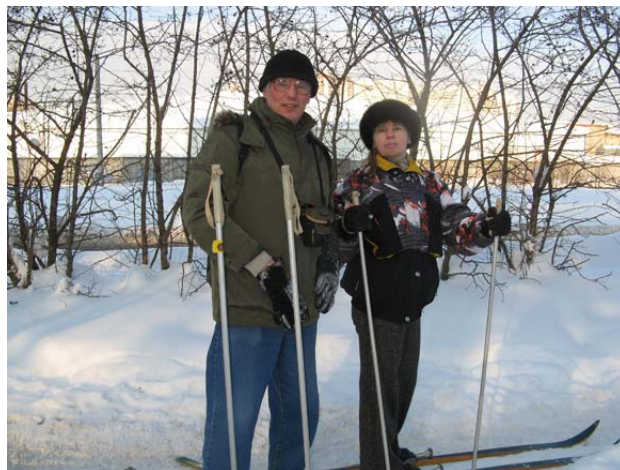
Sunday morning skiing just outside the courtyard.

of coffee and cognac healthy enough when it is -10 C.