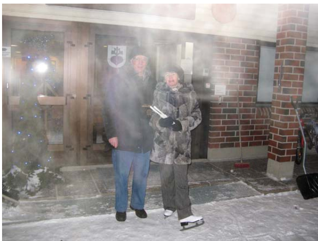
In front of the hotel (you see the breath).

That saved me lots of efforts. Return (or retrieve) into the worm hotel lounge was the most exciting episode.