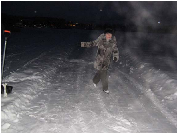
Skating in Jyväskylä frozen lake (early morning).

That saved me lots of efforts. Return (or retrieve) into the worm hotel lounge was the most exciting episode.