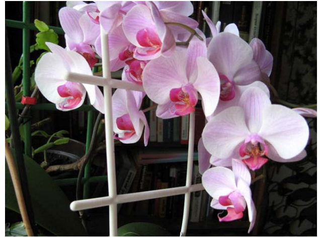
The domestic orchids.