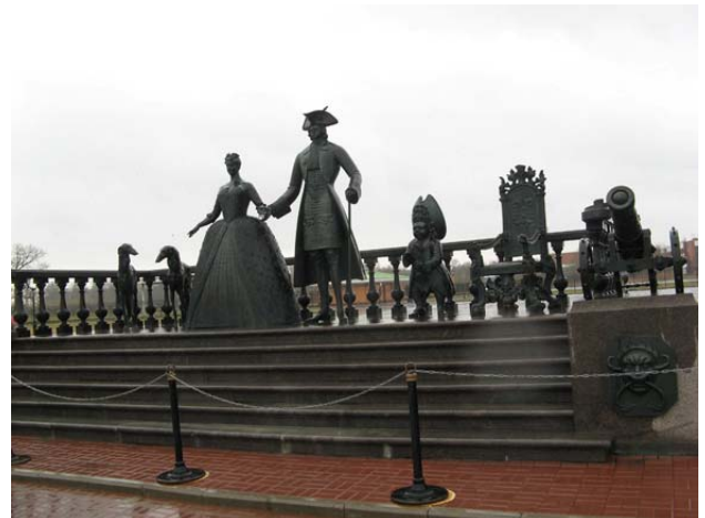
Mikhail Shemiakin's hemacht in the "welcome place" on the shore

We undertook a number of city and museum tours in the town itself and the suburbs. Watched things never seen before, like sculptures in the Konstantinovski Palace (the President's residence) done by M. Shemiakin.