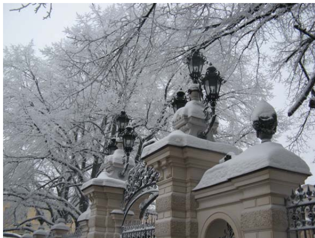
The Palace of Alexei Alexandrovich, a Zar's Brother, – next door to our Institute.

Wintertime brought piles of snow (both 2009/10 and 2010/11) and frost, making the town real beauty and wonder.