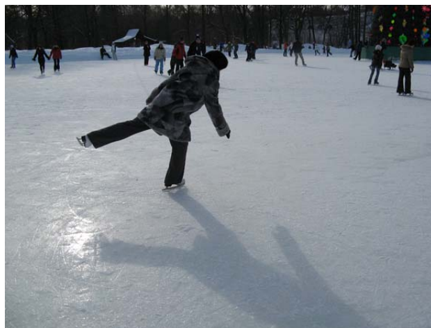
A skate practice (see next page for the outcome).