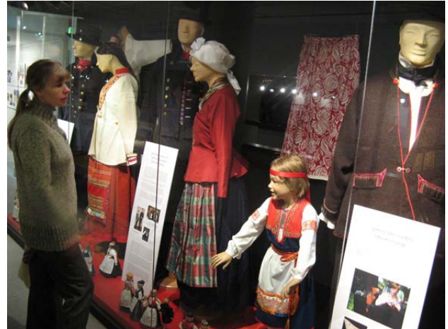
In the Falk museum.

Other adventures included visits to some nice museums (free on Fridays, and it was Friday), some shopping, and a visit to an AquaPark. I must admit the Finnish do know how to heat up a sauna to real stove. I could not stay there much for medical reasons, but the Turkish bath was good for me. Unfortunately, no photos allowed, and that was a pity as women attend the same cabin (separate entries).