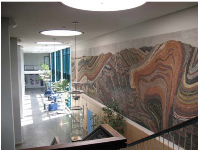
The BGR main entrance hall with a mosaic showing central Europe earth crust cross-section

I spent another three months in Hannover between April and July. This time my stay with BGR (Bundesanstalt für Geowissenschaften und Rohstoffe, if somebody is not familiar with this remarkable institution; photo below) was most overloaded by works and projects. Three manuscripts, two reports, current geochemical and isotope studies, and my bloody habilitation (doctorate) thesis left behind at home with the deadlines coming soon. So I found myself really busy with not much time for fun or even schpaß.