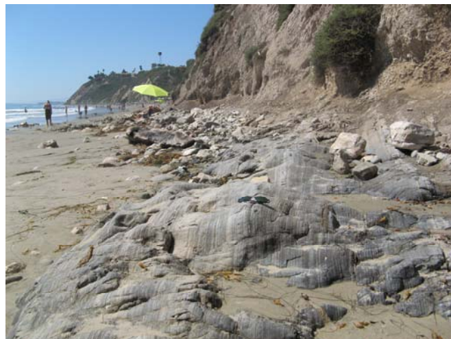
The source of CA prosperity

They also arranged an excursion to some rocks outcrops in close vicinity, where oil-bearing strata crop out (photo below, note thin black layers which are turf). It can be not easy to scrape the turf off your skin after swimming and walking down the beach. The latter is beautiful, the sand hot and fine and they do not charge anything for all that.