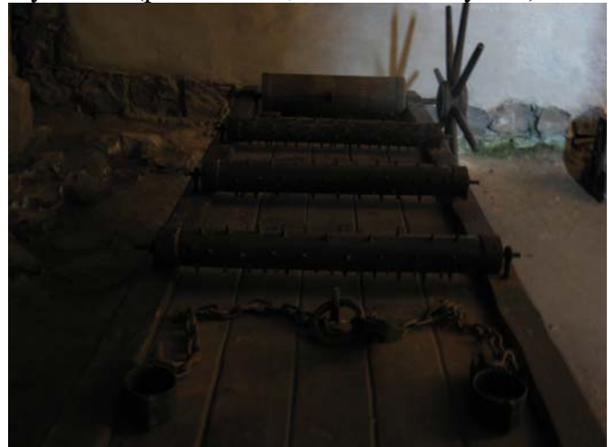
A torture machine

As to me, the most interesting trip was to Burg where we visited an old semidestroyed castle where well known (in Polish history) countess Kossel lived for long years. The ruins still contain the smell of old ages, and I liked best of all a torture machine which I would love to employ on my bosses (photo below, but no bosses yet in).