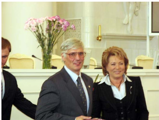
With the Governor

It was very nice to get the award from the city Governor Valentina Matvienko (photo below), whom I never met by person before. As a matter of fact my son used to meet Governor when she purchased books in the store he runs.