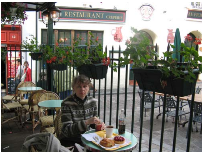
A cup of coffee in Monmartre

Anyway, we liked the trip very much. We saw a lot museums, streets and parks, took a boat trip, dined in what we thought was typical Paris cafes (photo down left column). Being cheated in a hotel