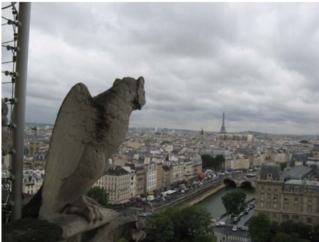
Looking west from Notre Dam de Paris

Alla came to join me in Hannover in June, and we managed to jump to Paris for three days booking the trip through Internet. Paris is something very romantic in Russian mentality and this name is firmly associated with majestic breath of freedom, love and joy. These days those things may be hardly found. The city itself is not that nice as commonly being admitted, and its beauty is much overestimated. All the same architecture occurs throughout (at least what we saw in three days), the buildings are all the same size and the same grey or dusty yellow colour, sometimes scaring (photo below) and rather boring altogether. Of course the Louvre and other places are much better decorated and the interior luxury startles. But the outsides are losing. Sorry, but St Petersburg looks much better: variegated, bright, harmonious. I think Viktor Hugo could not do his "Notre Dam de Paris" in our city. However, the novels by Dostoevsky also are not that funny.