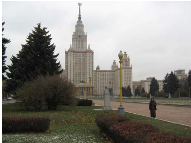
In front of the University

Alla, as usually, was with me the days before the reading providing help, support, shelter and everything. It seems it was much more difficult for her to get through that reading than for me. Fortunately she got at least one reward staying some days in the Moscow University (photo below) hotel in de luxe apartment (what they called such in 1950-s). It happened to be Alla's dream to stay in the MU.